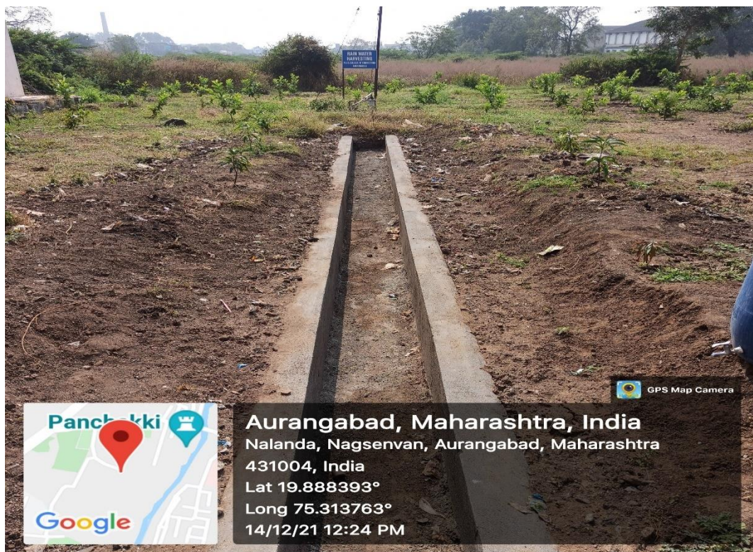
Bore Well/Open Well Recharge